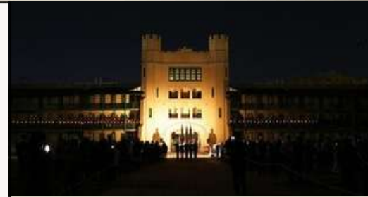
Alumni Reported Deceased January 29, 2026