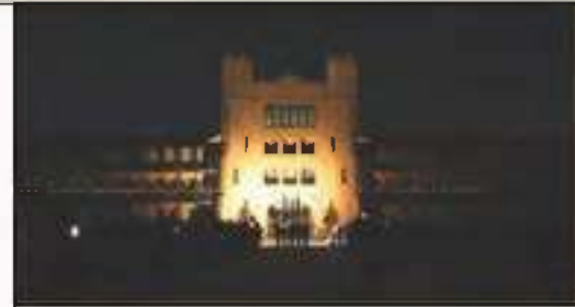
Alumni Reported Deceased October 31, 2025