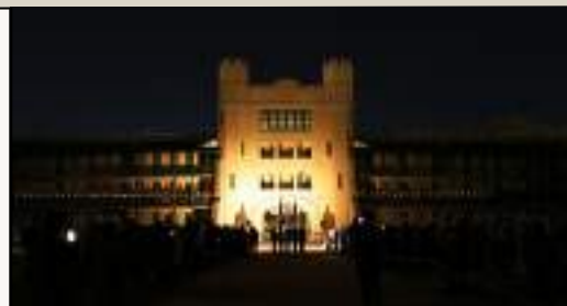
Alumni Reported Deceased August 1, 2025