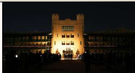
Alumni Reported Deceased March 31, 2025