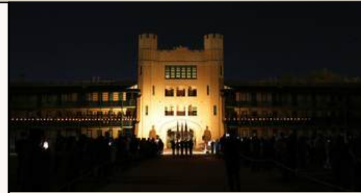
Alumni Reported Deceased January 31, 2025