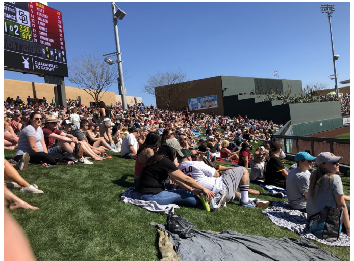
NMMI Alumni After Hours