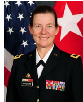
As a Former Cadet in 2012!

NMMI's first female Brigadier General. She assumed command of DLA Distribution on 29 June 2012.