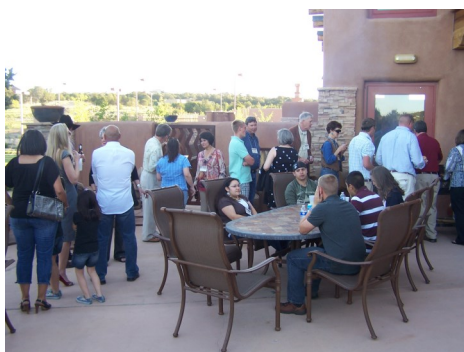
Photo from the 2010 Orell BBQ.