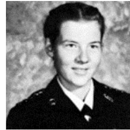
As a Cadet in 1983.....